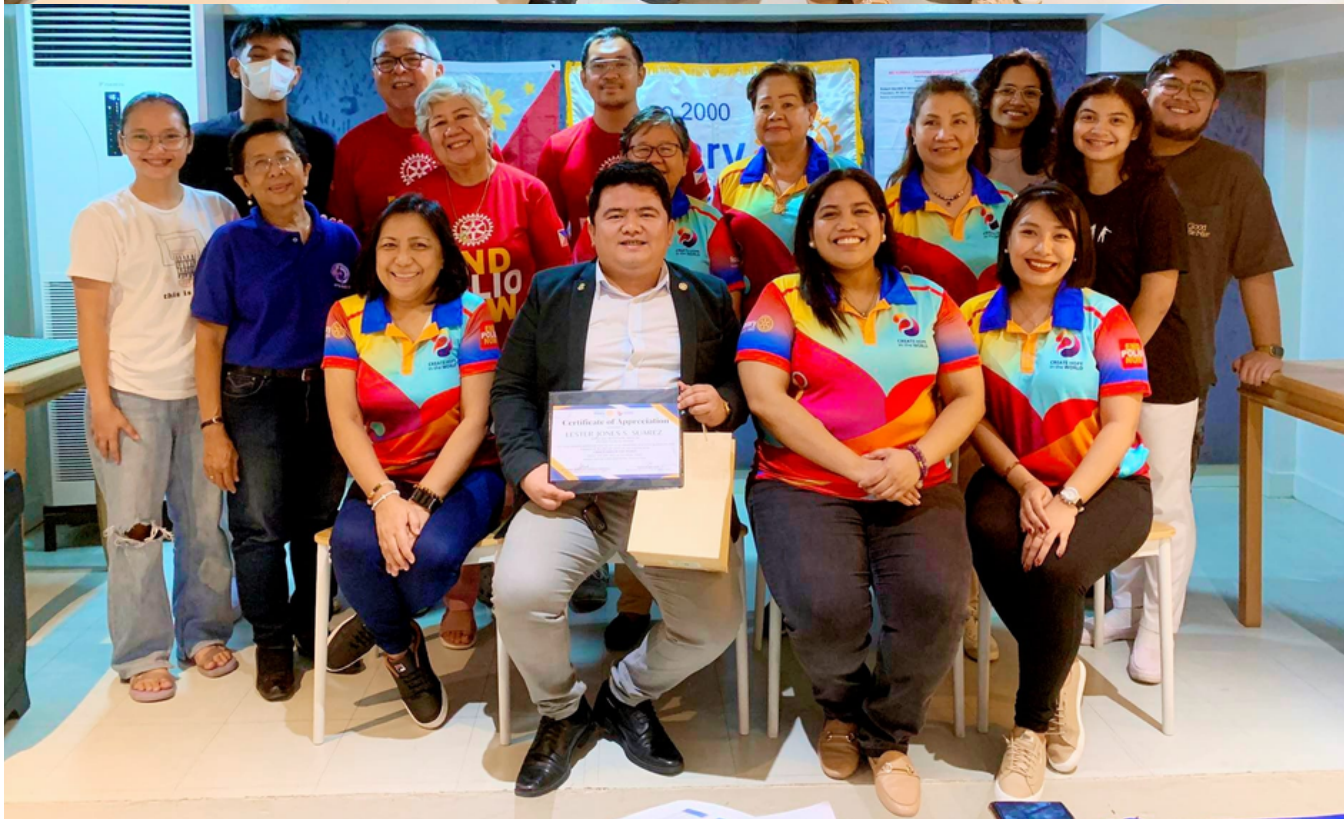
WITH ASISSTANT GOVERNOR, AREA 2A LESTER JONES SUAREZ